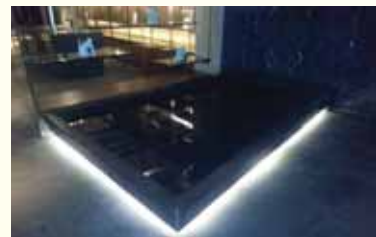
Finished SGRP Pool